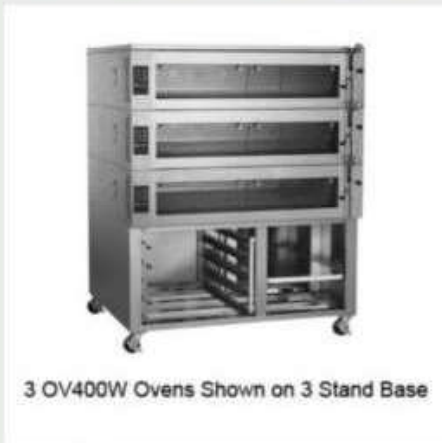
3 OV400W Ovens Shown on 3 Stand Base